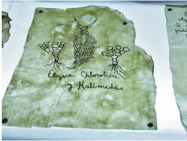
Skin book. Chlorophyll tattoo on microbial cellulose.

travellers must pass to get much of anywhere in the world. The chip, gene, bomb, fetus, seed, brain, ecosystem, and database are the wormholes that dump contemporary travellers out into contemporary worlds” (HARAWAY, 1997: 43). TransPlant engages in current debates about the Anthropocene from a perspective that is not based on human exceptionalism and methodological individualism, but that addresses the world and its inhabitants as the product of cyborg processes, sympoiesis or becoming-with in “multispecies muddles” (HARAWAY, 2016: 32).