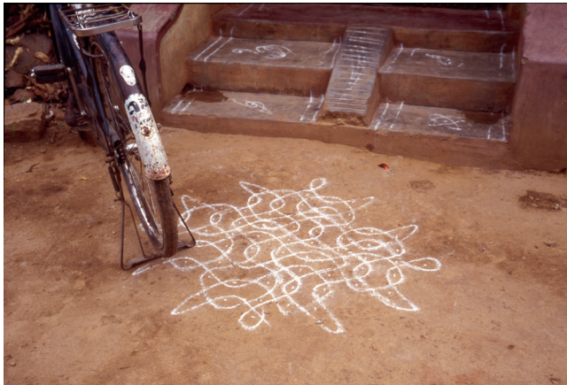
Tamil threshold designs are not considered precious and everyday activities are carried out without concern for preserving the designs. In fact they are drawn to be erased by the community's everyday activities. The photo shows a bicycle parked on a traditional Tamil loop design drawn around a grid of dots in front of a residential dwelling.

The drawing of threshold designs is an ancient, pan-Indian practice with disparate regional design styles. It constitutes a daily, domestic, female routine in which the whole community participates: the women draw the designs twice-daily and the community witnesses their presence, but also erases the drawings as part of the ebb and flow of everyday activities (see image below). The designs' creation and deletion are everyday motions that are perfunctorily performed. The Tamil version of the practice is referred to as kolam , and will form the basis for this discussion. Tamil designs traditionally are abstract compositions created by looping continuous lines around a structure of grids that determine the design (see p. 87). The women think of the practice as housework rather than art. It has communal and ritual dimensions, and is located on the "other", invisible side of Santos's abyssal line as a cultural practice: even though the designs are in public view on the streets of the Tamil Nadu, they have, as the cultural anthropologist Stephen Huyler noted, along with other female decorative arts of India, "received almost no recognition" (HUYLER, 1994: 10)