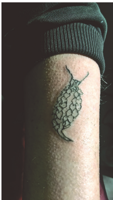
First chlorophyll tattoo. Transplant: Performance #1 “Devenir chienne pour devenir plant”. Transpalette Art Center, Bourges, France. November 2016.

our era constitute fertile terrain to build new alliances.