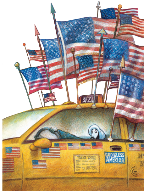
Carter Goodrich, Untitled , 2001. Watercolour and coloured pencil. Cartoon used for cover of November 5, 2001 issue of The New Yorker .

Given that the terrorist attacks of 9/11 were ascribed to Middle Eastern and Islamic, or Muslim, radicals, American legal scholar Leti Volpp surmises that those who appear “Middle Eastern, or Muslim-looking” – she mentions Latinos and African-Americans, for instance – practically became a new identity category in terms of United States citizenship (VOLPP, 2002: 1575). Although the American flag became increasingly visible as a marker of patriotism after 9/11, the cartoon indicates that for some subjects, displaying the flag became a necessity to prevent any potential misidentification as not only a terrorist, but as “not” American. 9 Indeed, this is at least part of the reason my own parents put various flags – that are still up – in their dry cleaning business, especially after receiving at least one threatening phone call that I know of to “go back home” after 9/11.