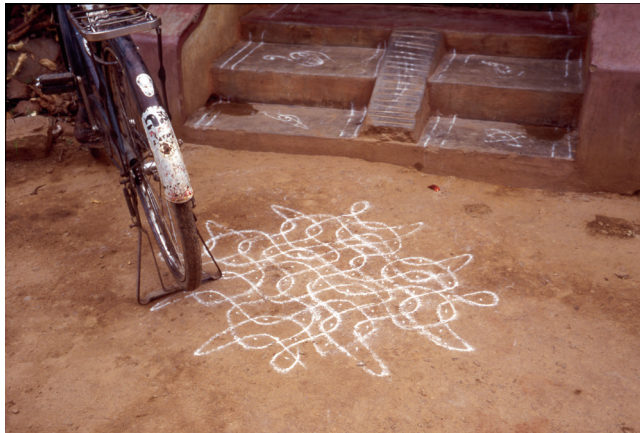
Tamil threshold designs are not considered precious and everyday activities are carried out without concern for preserving the designs. In fact they are drawn to be erased by the community's everyday activities. The photo shows a bicycle parked on a traditional Tamil loop design drawn around a grid of dots in front of a residential dwelling.

The drawing of threshold designs is an ancient, pan-Indian practice with disparate regional design styles. It constitutes a daily, domestic, female routine in which the whole community participates: the women draw the designs twice-daily and the community witnesses their presence, but also erases the drawings as part of the ebb and flow of everyday activities (see image below). The designs' creation and deletion are everyday motions that are perfunctorily performed. The Tamil version of the practice is referred to as kolam , and will form the basis for this discussion. Tamil designs traditionally are abstract compositions created by looping continuous lines around a structure of grids that determine the design (see p. 87). The women think of the practice as housework rather than art. It has communal and ritual dimensions, and is located on the "other", invisible side of Santos's abyssal line as a cultural practice: even though the designs are in public view on the streets of the Tamil Nadu, they have, as the cultural anthropologist Stephen Huyler noted, along with other female decorative arts of India, "received almost no recognition" (HUYLER, 1994: 10)