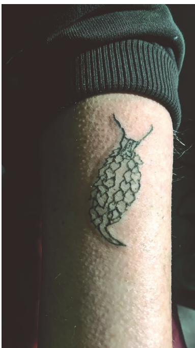
First chlorophyll tattoo. Transplant: Performance #1 “Devenir chienne pour devenir plant”. Transpalette Art Center, Bourges, France. November 2016.

our era constitute fertile terrain to build new alliances.