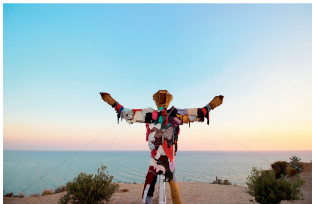
Sergio Barbàra, The great Hug (Photograph of the site-specific installation for Scala dei Turchi White Wall). Photographic print on forex 50 × 70 cm, 2016.

word that fades in the middle of the sea and a hard copy with the co-ordinates of the distances between the centre of the Mediterranean and the edges of its shores: on one side Tunisia, one of the places from which the unregistered migrants embark to seek their dreams of peace and prosperity; and on another side, Lebanon, a country that suffers the trauma of war and where terrorism affects not only the population in its right to life, liberty, and security but also Nature itself, devastated and treated without any respect. Thus, the ecological debt generated by wars and terrorism is incalculable.